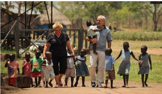
Greetings from Harvesters,

I am always so happy when I return to Sudan. Every time I come home, I am greeted by all the children and staff who always seem to be doing well while I am away!