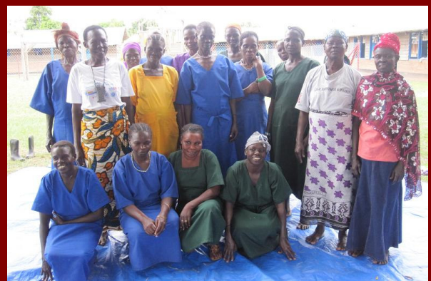
Members of our women's cell group