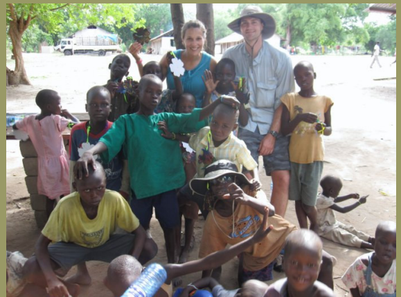
Some of the e3 Partners Team who ministered to villagers in Terekeka.

I have been reflecting on the verses where Jesus said that if He would be lifted up, He would draw men to Himself. I think about our kids and how they love to sing praises to our Lord. It seems like singing and dancing for the Lord are two of their favorite things to do. We believe this will change the atmosphere of Terekeka, and Jesus will draw men closer to Himself, either through teams, our pastors, our kids, or even through their visions and dreams. We believe there is such purpose for the Mundari people and are so thankful to have a small part in their journey towards a life with Christ.